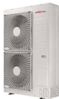
Outdoor Unit: MMLD030S6S-1P