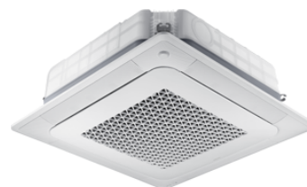
Indoor Unit: M33D030S6-1P