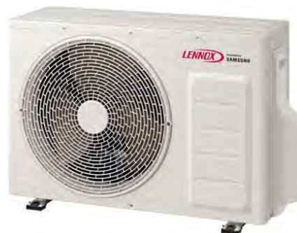
Outdoor Unit: MMLD009S6S-1P