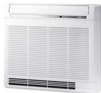
Indoor Unit: MFMD009S6-1P