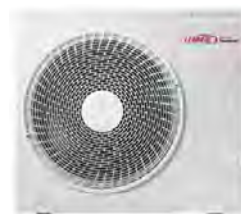
Outdoor Unit: MMPD024S6S-1P