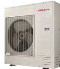
Outdoor Unit: MWHD024S6S-1P