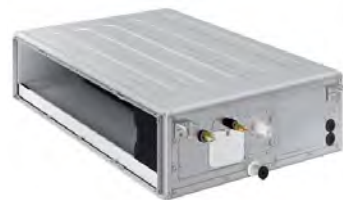
Indoor Unit: MDDD018S6-1P