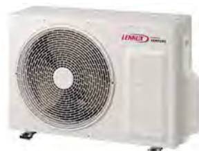
Outdoor Unit: MMPD018S6S-1P