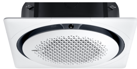
Ceiling type panel (Square)