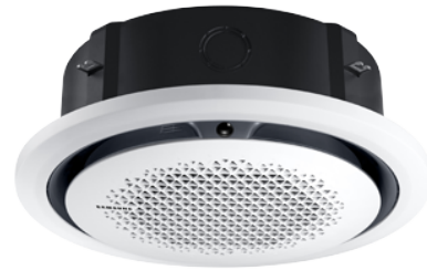
Open type panel (Round)