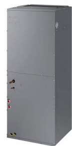
Outdoor Unit: MMLD036S6S-1P Indoor Unit: MMD036S6-1P