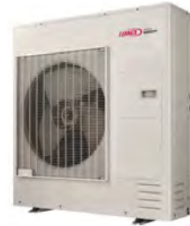
Outdoor Unit: MWLD024S6S-1P