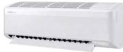
Indoor Unit: MWMD024S6-1P