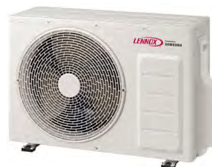
Outdoor Unit: MMLD012S6S-1P