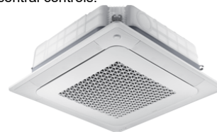
Indoor Unit: M22D012S6-1P