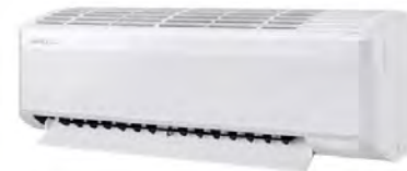
Indoor Unit: MW<D018S6-1P