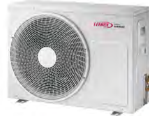
Outdoor Unit: MW<D018S6S-1P