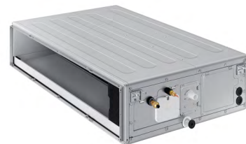
Outdoor Unit: MMLD009S6S-1P Indoor Unit: MDDD009S6-1P