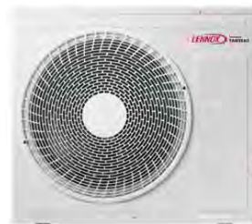
Outdoor Unit: MMLD018S6S-1P