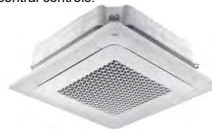
Indoor Unit: M22D018S6-1P