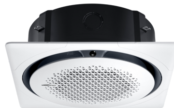
Ceiling type panel (Square)