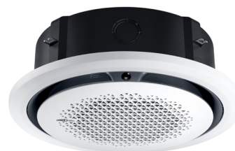
Open type panel (Round)